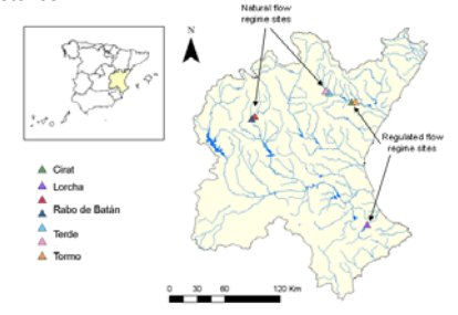
Fig.1 Location of the study sites (Jucar River Basin District)

The Júcar River Basin District is one of the most relevant watersheds in the Mediterranean region of Spain both for its size and for the high regulation which is subjected to. The district system includes Mijares, Serpis, and Cabriel rivers as three of the most relevant ones. The objective of this work is to evaluate how hydrological changes are affecting riparian vegetation in some representative stretches.